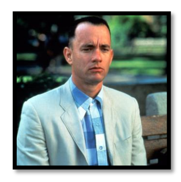
The Antagonist – Forrest Gump